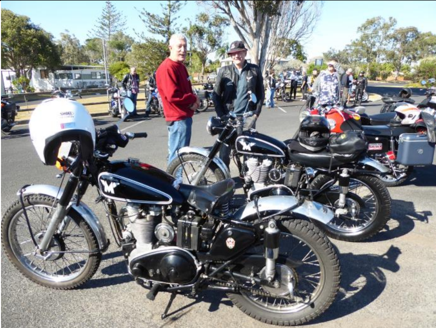
Matching Matchless At 2017 Rally

A breakfast run is held on the Sunday immediately following the club's monthly meeting. A classics only run is held on the first Sunday of the month. Both runs start at the Blue Kitchen Café, Windmill Grove, 105 Wilson Street, South Lismore at 8.30 am. Every Sunday can be a club run but members must contact the Events Organizer. Club events are also listed on the club website. There are also 2 Mid-week runs departing Lismore railway station on 1st and 4th Wednesday of the month at 9 am. .