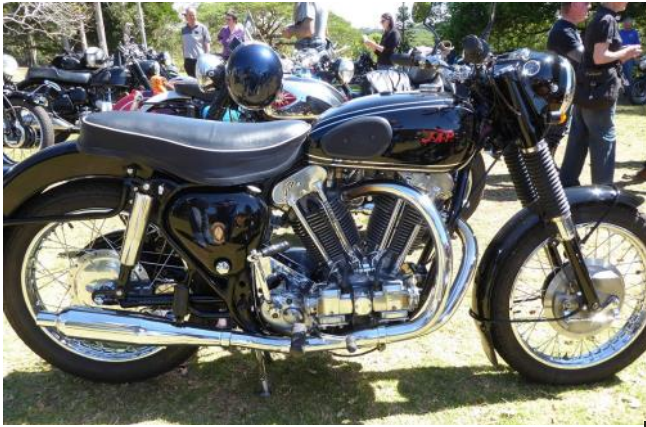
Left: Peoples Choice Winner— 1954 BSA/JAP 100cc V twin . This bike has been to many of our club rallies 3