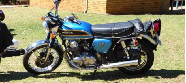
Some 2017 Rally photos

Dear LTT Founding Members, Guests, & Affiliates.